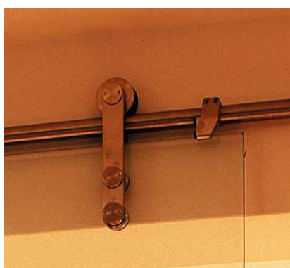
The MANET sliding door system from DORMA provides a transparent entrance solution characterised by easy, effortless operation.