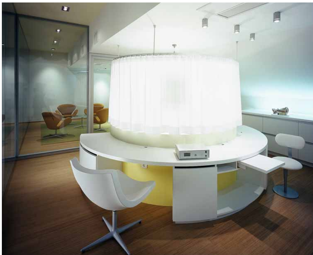
The therapy area: the well of the central stairway is enveloped by a curtain which also serves as a light source. Located around the staircase is a semi-circular desk with cupboards below and pull-out workboards.