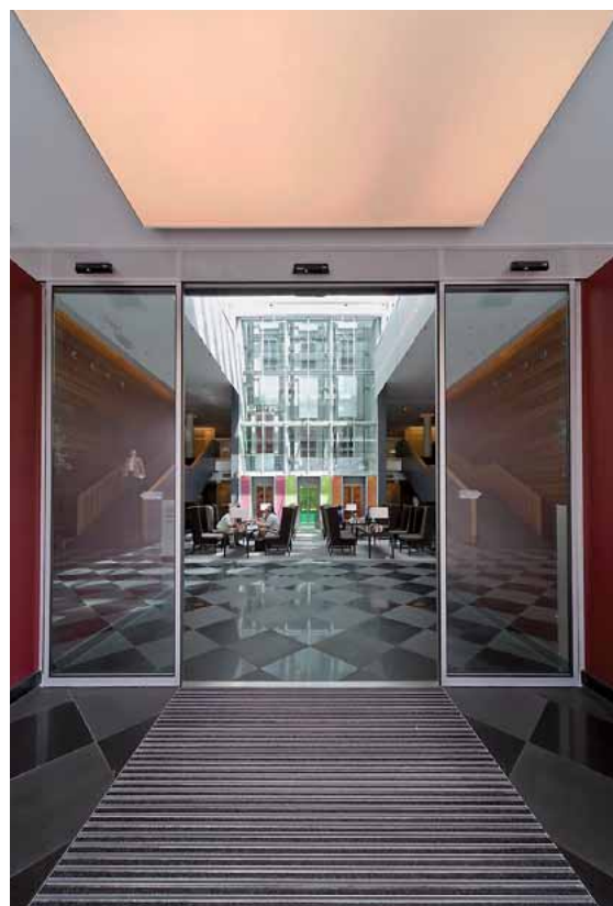
The automatic sliding door operator from DORMA elegantly parts to allow passage at will.