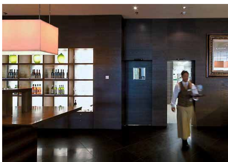
The integrating interior design concept with its relaxing elements has been strictly adhered to throughout the restaurant area.