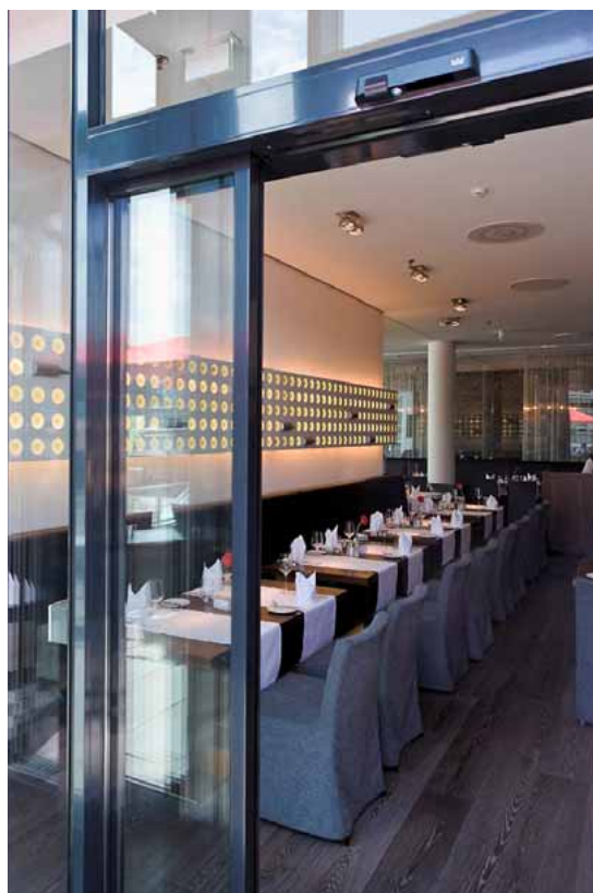
The access to the restaurant is also protected by a telescopic sliding door from DORMA.