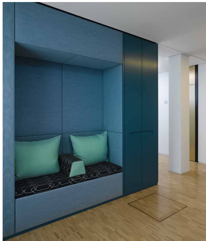
Open and enclosed zones alternate, with the corridors designed with vivacious detail serving as fully fledged rooms in their own right.