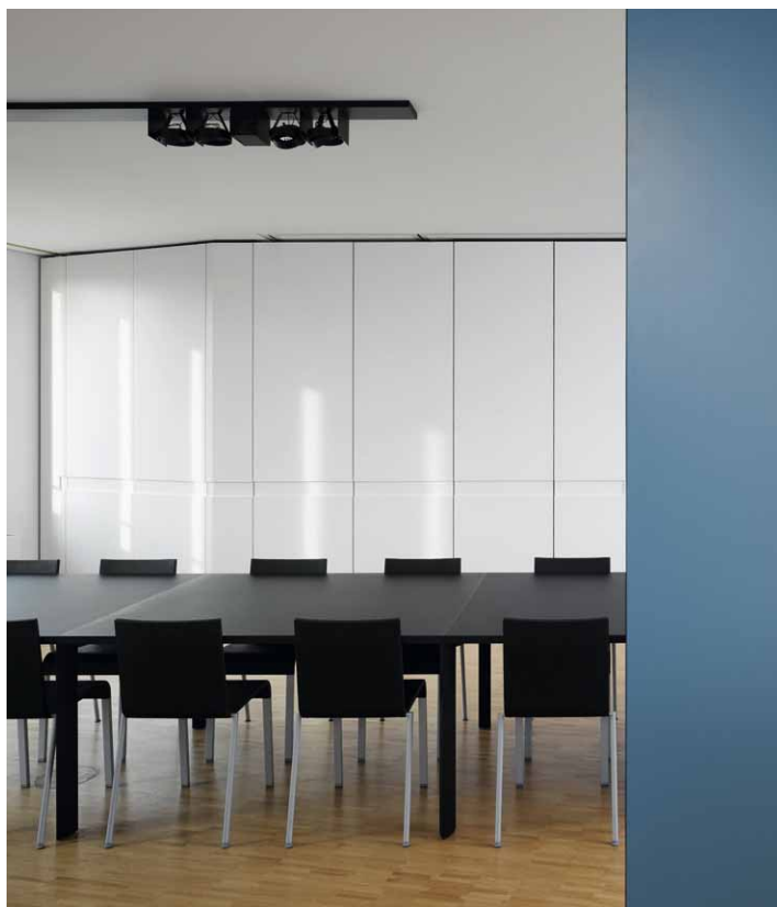
The offices and conference rooms benefit from the flexible space management capability available with the MOVEO operable partition with its full-face panelling, a solution made for quick and easy room size modification.