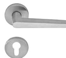
High-quality lever handles from DORMA underline and enhance the sophistication of the interior design.