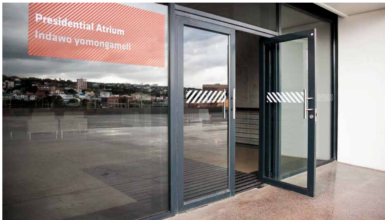
Installed for almost total invisibility, the BTS 75 floor spring integrates elegantly within the door system.